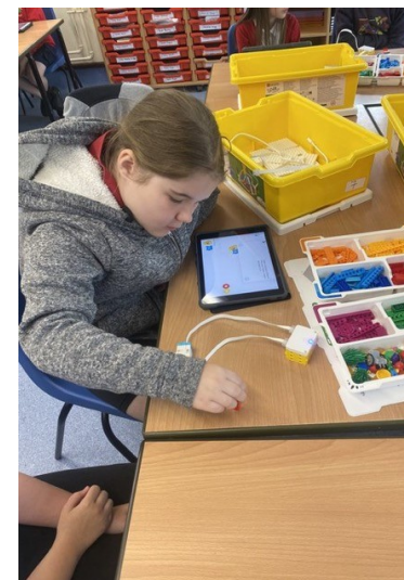
Coding using the new Lego Spike kits.

No meeting was held under Section 94 of the School Standards and Organisation (Wales) Act 2013.