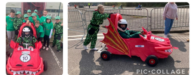
Images of the STEM team, who made, designed the bodywork, and drove, not one, but two cars in the Greenpower race!! Winning not 1 but 3 awards!!!