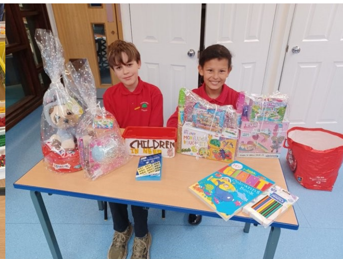
Our lovely school council reps will be selling raffle tickets all week for these wonderful prizes! All to raise money for Children In Need