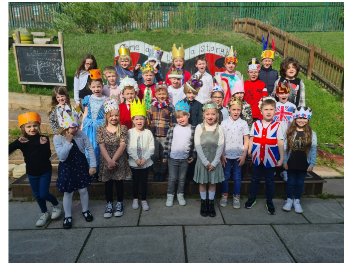
Celebrating the Kings Coronation.

School Council have held Assemblies to promote healthy eating and drinking. They have spoken to the children about the healthy snacks that are available at break time and have asked the canteen to increase the choice of fruit on offer.