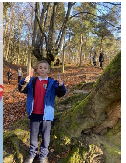
Enjoying the great outdoors in the Forest School Area.